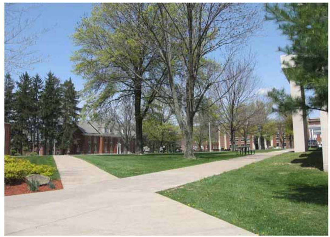
West Liberty University - President's Residence